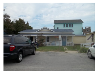
Our new addition next door

We are open Monday through Saturday, 10 am till 6 pm at 500 S. Croatan Hwy in KDH. Come see us!